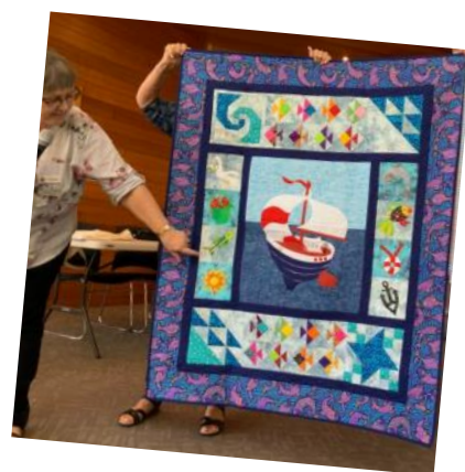
A few pics from our March meeting.