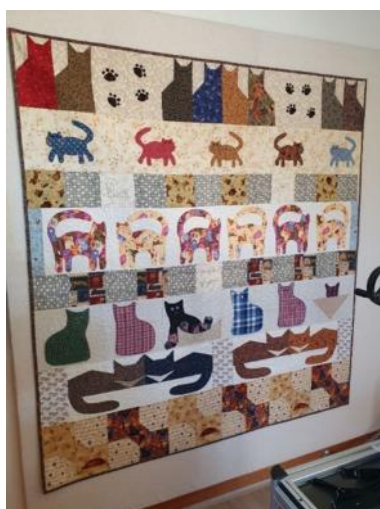
A few more of Pip Scholten's Friendship Quilts