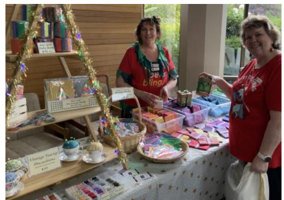
That's me on the right!