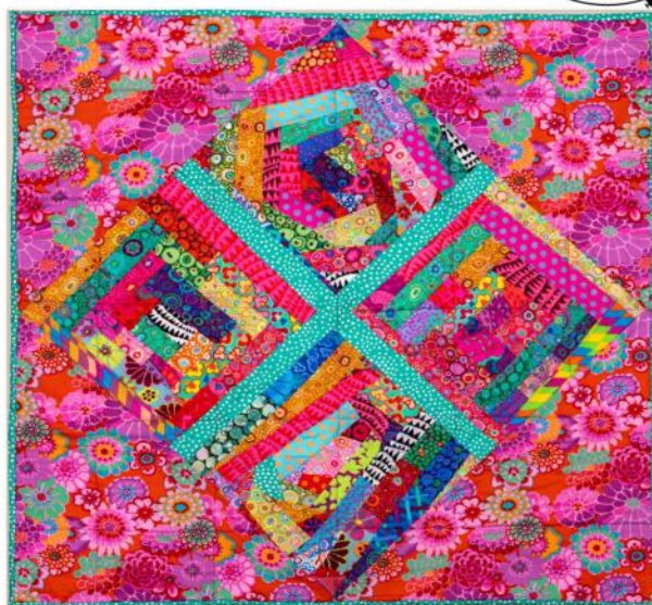
Teva Kafr Field of Flowers