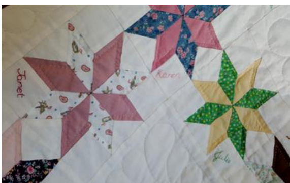
Close-up showing some signatures of the LPQ members who contributed to the "Starry Path" quilt.