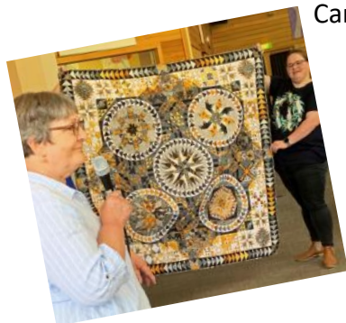
...and talent on show!