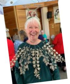
Dressed for fun!