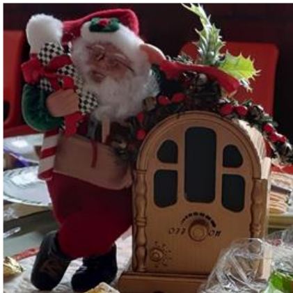
Cute Christmas decorations!