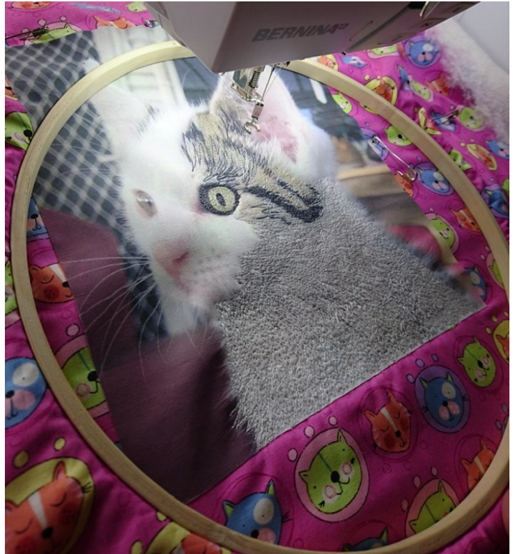
The thread painting workshop with Barbara Mellor