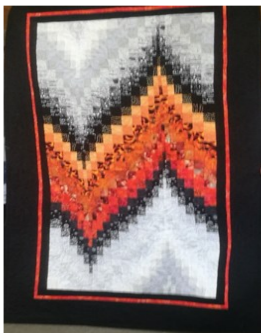
Other Members' Quilts