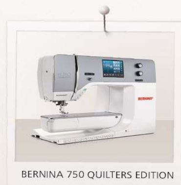
BERNINA 750 QUILTERS EDITION