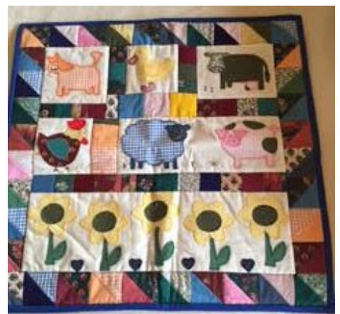
very first attempts at a wall hanging