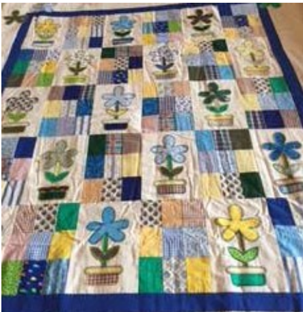
This one needs finishing. I love flowers.