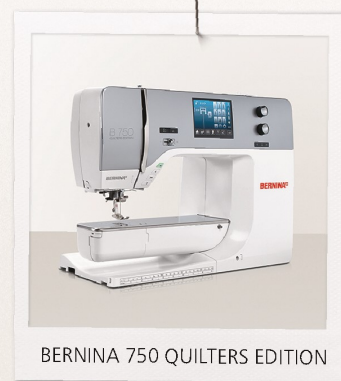
BERNINA 750 QUILTERS EDITION