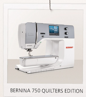
BERNINA 750 QUILTERS EDITION